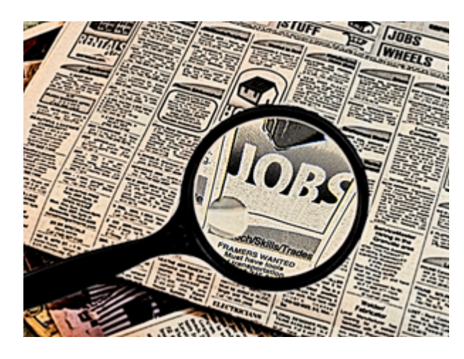
Are there Jobs?